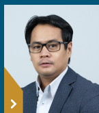
> Ryan Garcia