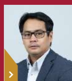
> Ryan Garcia